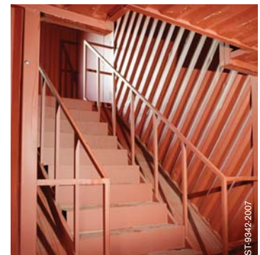
Interior Stairwell is equipped with hand rails on either side which adhere to OSHA regulations.