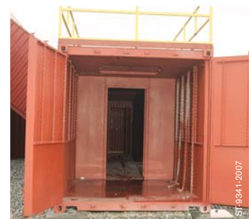
The Phase 5 System – The Burn Chamber located on the first floor.

This workshop is conducted by two experienced instructors. These instructors have conducted at least 100 training evolutions in a Phase 5 system. This training and certification process assures that instructors are thoroughly familiarized with the safe and effective use of the Phase 5 training system.